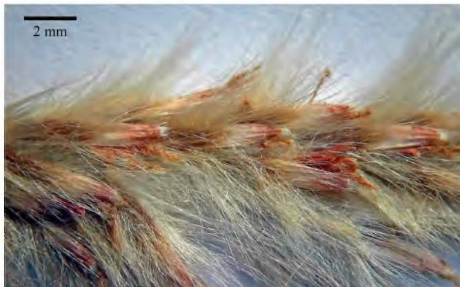
Fig. 4. Eulalia simonii . Part of inflorescence ( Ridley BES 00767 , PERTH).